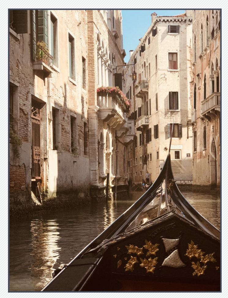
First Place: "Gondola Ride"