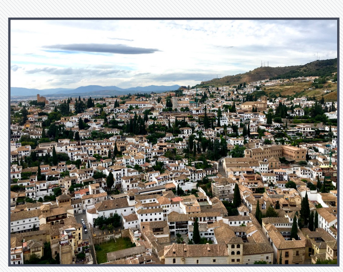
Third Place: "Albaicin"