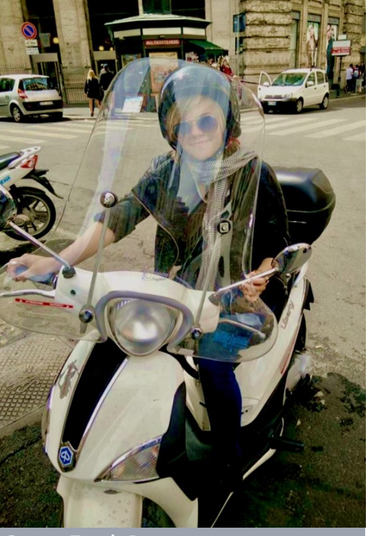
Scooter Tour in Rome.

Bologna, and Florence, and it was much cheaper than other programs in larger cities. This program also had several courses that fit my degree program at WT, yet allowed me to take some fun courses as well, such as my Italian cooking course. Though I studied abroad to gain more independence, the program provider, USAC, supported me in almost every aspect of their time abroad, including applying for a visa, getting housing, taking a language course, and getting a residency permit. I got so lucky to be in a program where I was given the opportunity to enjoy traveling and meeting new people without having to figure out the more difficult things alone. The program had over 60 participants, mostly Americans and only two boys. I originally was terrified about my ability to make friends with this group, but it took less than a week for me to make some amazing travel companions and life-long friends. The group I became a part of was an eclectic one, and everyone's weird just kind of meshed well together. We travelled to several different countries together, ate a ridiculous amount of Nutella and gelato, and even accidentally went to Rome. We had gone on a day trip