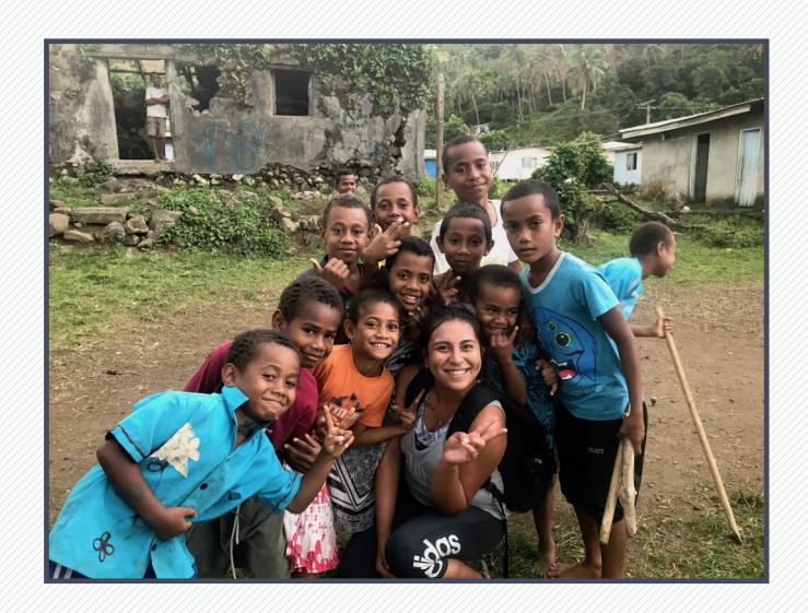
Third Place: "Blissful Day"