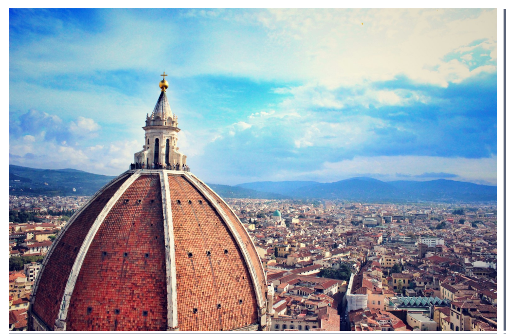
Florence Cathedral and view of city.