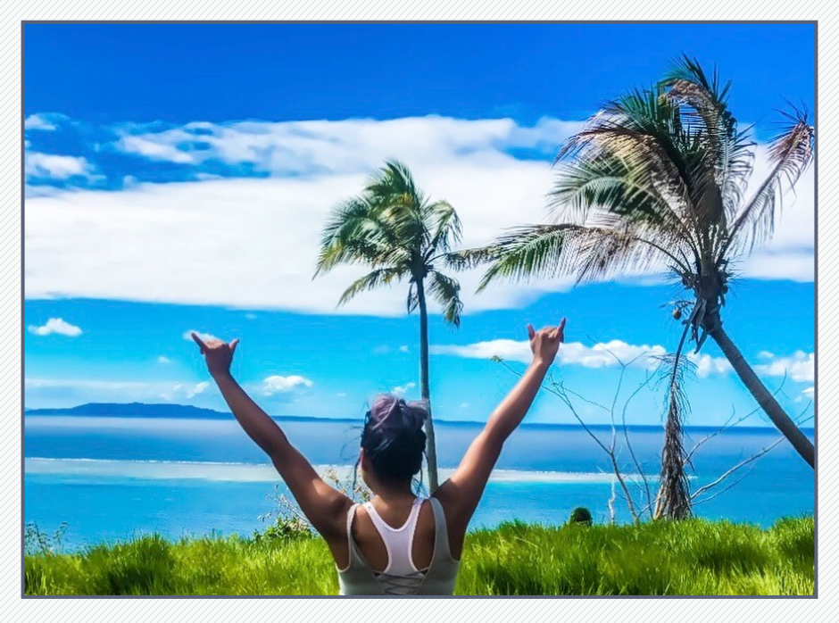
"Buffs in the Sun" Fiji